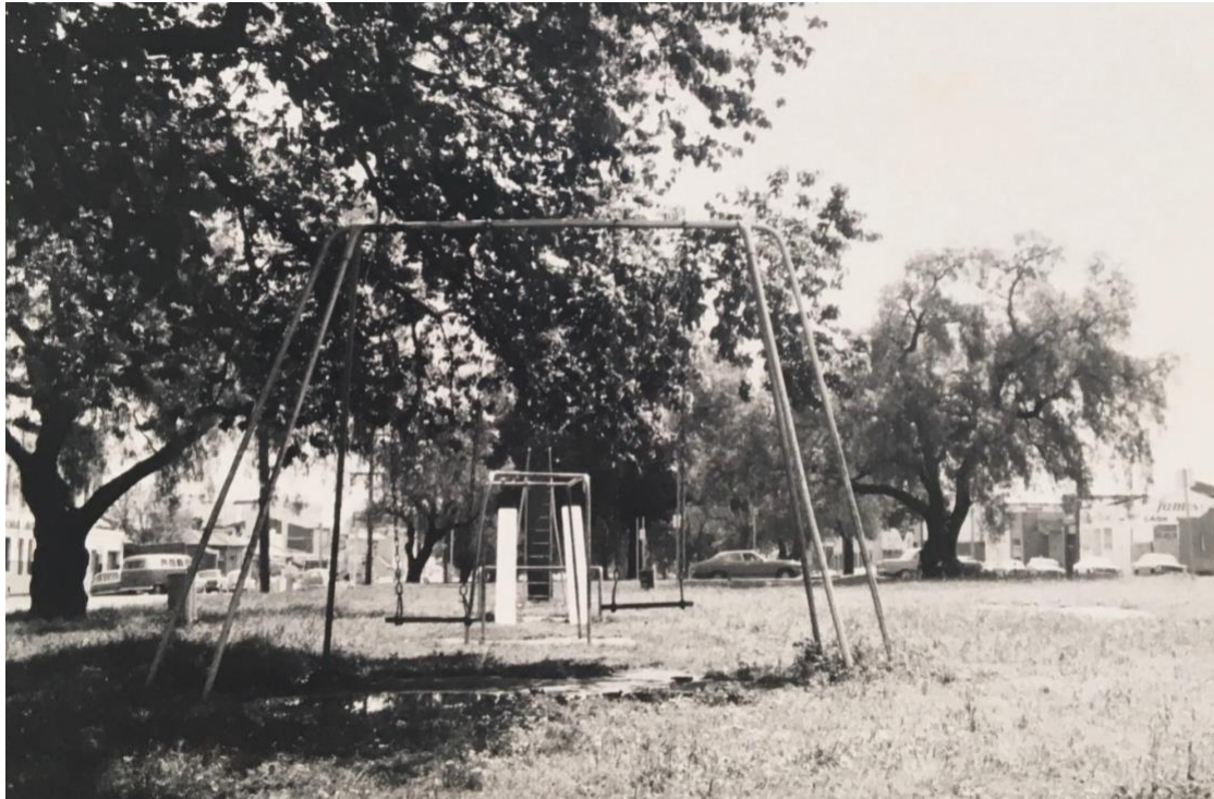
Alexandra Parade playground before freeway construction

The Metropolitan and Melbourne Board of Works (MMBW), constructing authority for the freeway at the time, acted promptly once approval was given, to the frustration of those who were still disputing the government's decision. In November 1971, the Board bulldozed ten acres of the Yarra Bend Park in advance of the passage of the necessary enabling legislation. An acutely embarrassed government only narrowly averted a threat by its backbench to join the opposition to force a breach of parliamentary privilege inquiry.