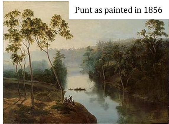
Punt as painted in 1856