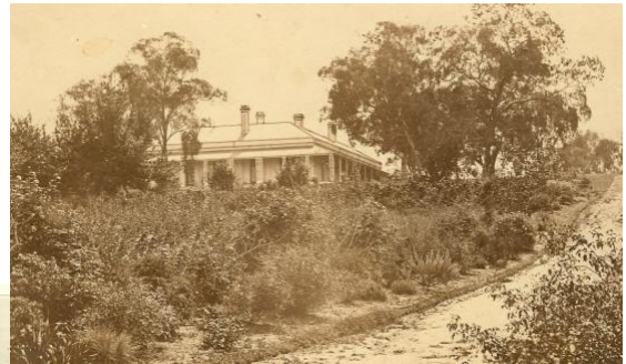
Abbotsford House, and the December 1852 auction plan

*If you can't climb steps, walk up Clarke Street, turn left into Marine Parade, left into Nicholson Street, and resume the route at Stop 5, 200 Gipps Street.